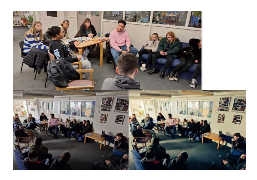
<u>YS Logo</u> - Young people from across the South, Southeast area engaged in the choosing of the updated Youth Service logo, young people attending sessions were asked to vote on the three options. Overall, Three Hundred & Ninety-Nine young people engaged in the consultation from the SSE area.